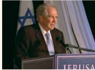
At a recent ceremony, Pat Robertson was honoured for his support of Israel.

your daily dose of inspiration in the new Spiritual Life section. Study the Bible, request prayer, and download materials for your church.