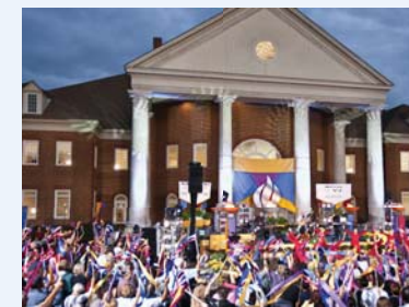
Every year, our staff gathers to rejoice in God's faithfulness and to pray for partners.

unemployed for 16 months, and the couple contacted The 700 Club for prayer. God provided him with a job!