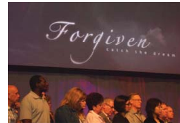
Canadian pastors and leaders

Two years later, a National Summit of the First Peoples of Canada convened to formally respond. In Ottawa on June 12, 2010, representatives from First Nations, Inuit and Métis from across the country met with Chuck Strahl, Minister