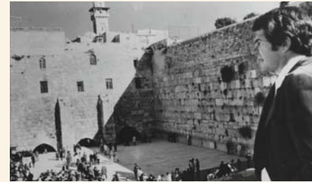
Pat Robertson on one of his many trips to Israel.

On Christmas Day in 1974, I had the privilege of interviewing Prime Minister Yitzhak Rabin in Israel for The 700 Club . Rabin lamented the fact that after Israeli military victories, the nation had been stopped from achieving a peace treaty.